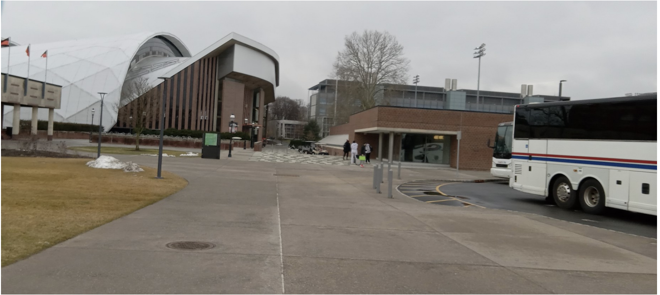
Walk pass the gym.